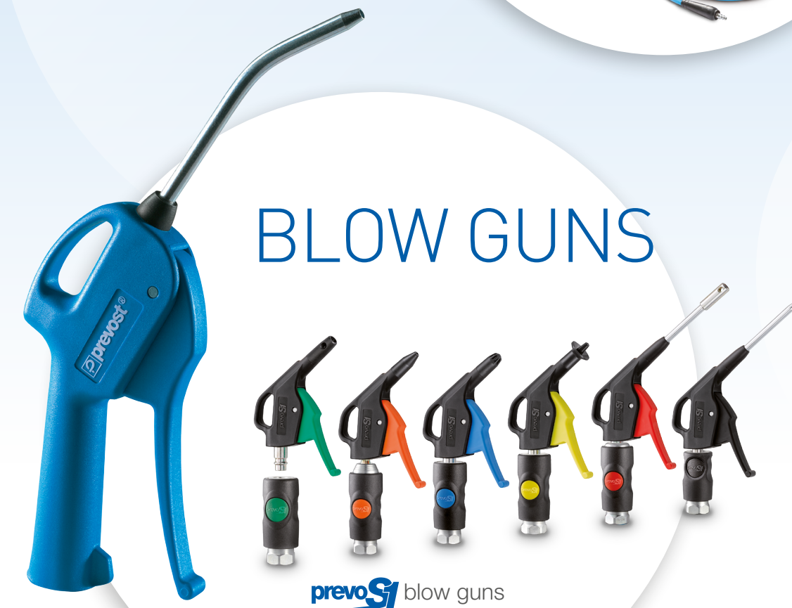
27102 blow gun