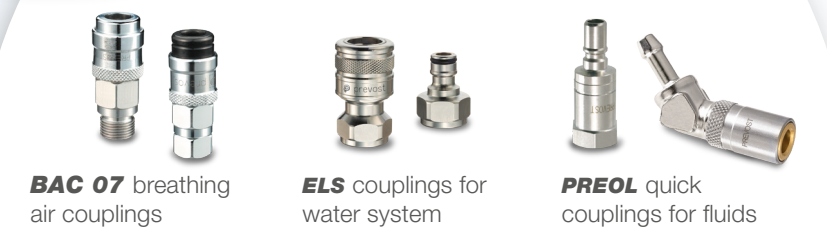
BAC 07 breathing air couplings