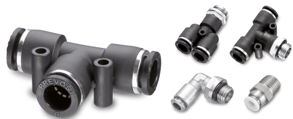
CONEX push-in fittings: polymer, metal, stainless steel