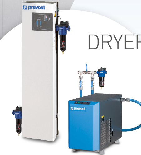
ALTITUDE and ALASKA