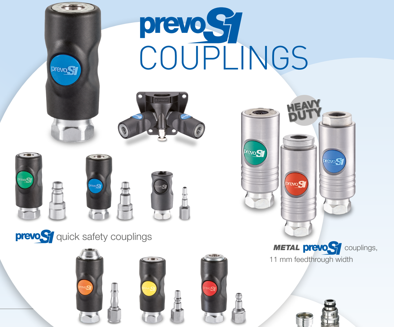
prevoS quick safety couplings